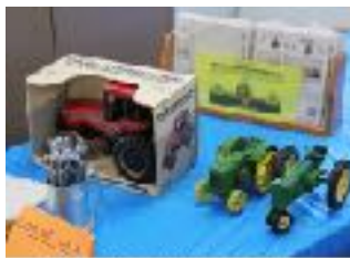
It is a tractor. It is not a toy. It is a tractor. It is not a toy. It is a tractor.