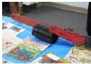
The observational picture series